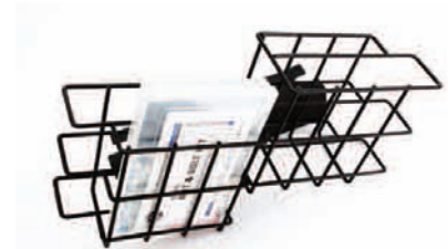
Accessory Basket (50-1057)

For assembly instructions please visit: www.procutusa.com/pdf/trolley_diagrams_50380_50390.pdf .