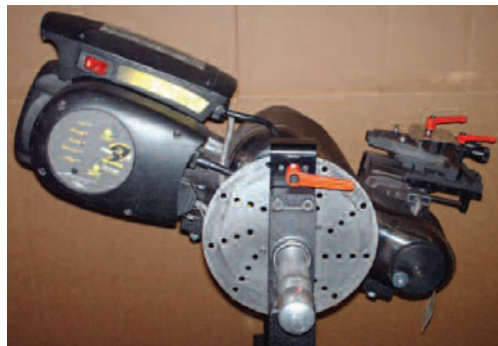
Lathe mounted on trolley