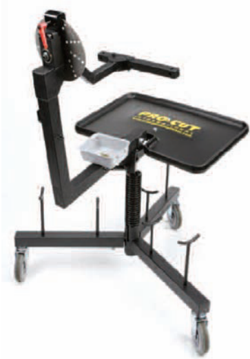
▲ 50-380 trolley complete

Pro-Cut is pleased to announce availability of the new 50-380 Standard "Disc-Lock" Trolley . The Disc-Lock design utilizes a dual sealed bearing hub for smooth 360-degree rotation, and a unique lever-operated caliper and cross-drilled rotor for positive locking during the critical adjustment and cut cycles.